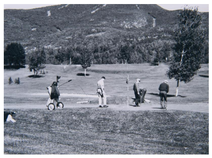
In 1960, development of a golf course for the use of the brothers was begun. The nine-hole course was completed four years later.